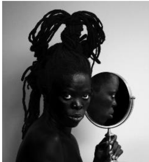
Figure 1. Zanele Muholi, 2019, Boston

right to undermine you - because of your existence, because of your race, because of your gender, because of your gender, because of who you are." ( https://www.tate.org.uk/ ) (Fig 1).