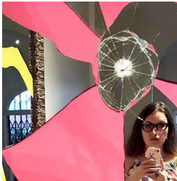
Figure 3. John Jonas, Mirror Piece 1, 1969

In Western examples, they play in connection with the use of mirrors or with the magic of illusion and deception in the form of reflection, failure, multiplication and distortion of space or invite viewers to experience materials and processes.