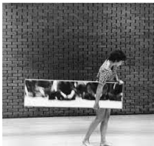
Figure 2. John Jonas, Mirror Piece 1, 1969

movements in front of spectators, alternately reflecting their bodies and surroundings and presented a flat view of themselves as an image within the performance to the audience. The photograph taken by the Guggenheim Museum is a rare document of the work taken by the artist herself. In it, a participant sits alone on the grass and holds a mirror that breaks her body and makes it almost surreal. Jonas, both literally and visually, denies the audience any position of stability that can comprehend what lies ahead (Fig 2).