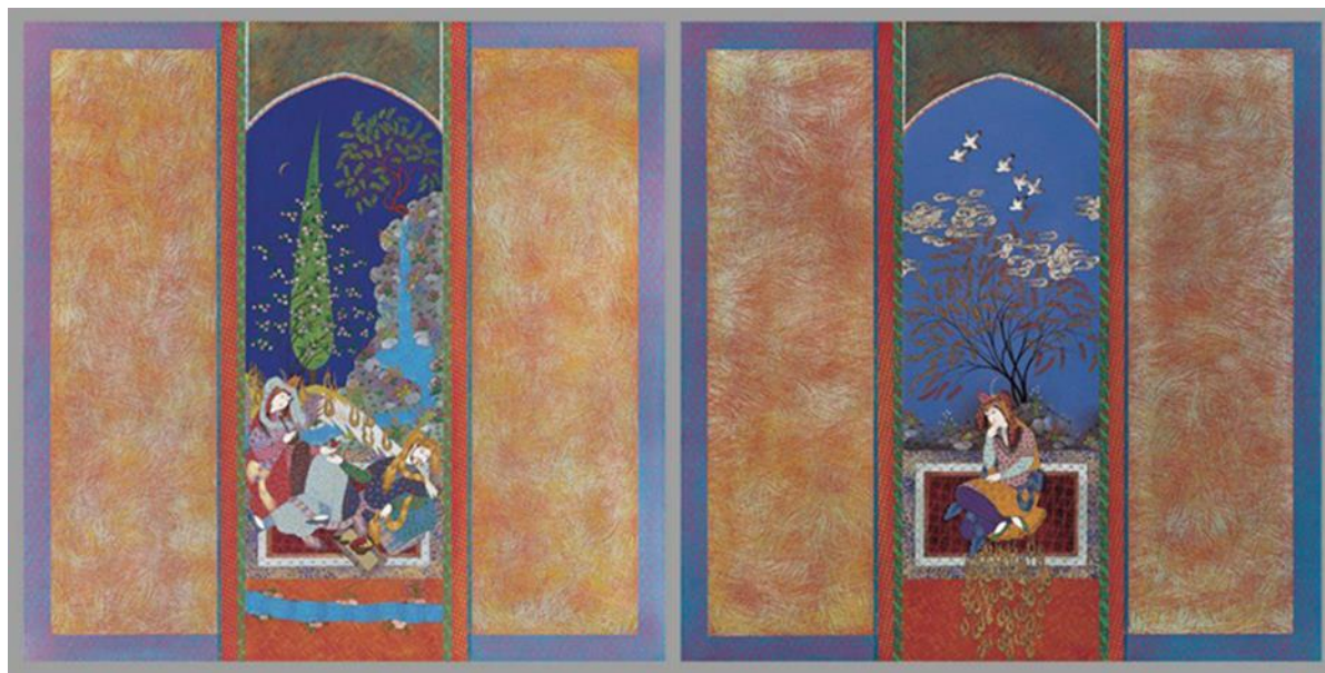
Figure 1- The Rival, two panels, 150*75, 2019, source: ( www.Farah_ossouli.com ). Metropolitan Museum of USA.

In the current study, an attempt has been made to provide a succinct overview of the life and works of Farah Ossouli. To do this, the library method, the descriptive-analytical approach, and the interview method have all been used. The final objective can be accomplished in accordance with the cited sources and individual receipts, and following this research and study, tables have been obtained.