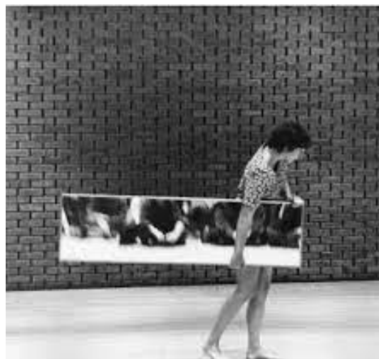
Figure 2. June Jonas, Mirror Piece 1, 1969

movements in front of spectators, alternately reflecting their bodies and surroundings and presented a flat view of themselves as an image within the performance to the audience. The photograph taken by the Guggenheim Museum is a rare document of the work taken by the artist herself. In it, a participant sits alone on the grass and holds a mirror that breaks her body and makes it almost surreal. Jonas, both literally and visually, denies the audience any position of stability that can comprehend what lies ahead (Fig 2).