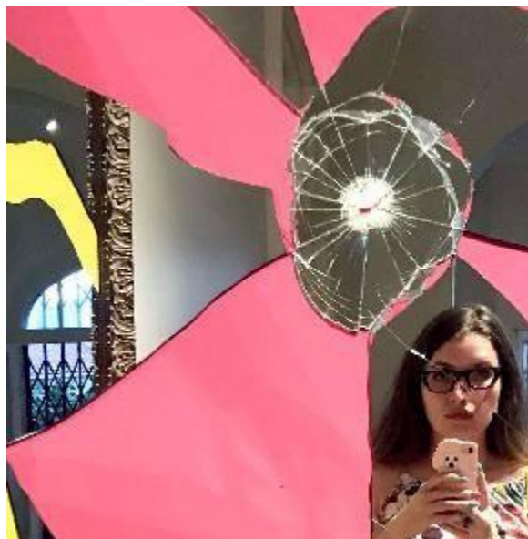
Figure 3. John Jonas, Mirror Piece 1, 1969

In Western examples, they play in connection with the use of mirrors or with the magic of illusion and deception in the form of reflection, failure, multiplication and distortion of space or invite viewers to experience materials and processes.